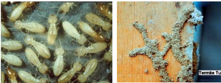
Figure 1. Left: Termite workers are soft, whitish and often blind ( www.timber.org.au ). Right: Termite attacked wood showing characteristic tubes under which the termites hide ( www.allpest.com ).

mechanisms, which local predators have not overcome. The mechanism is often temporary and does not always work. For example, some eucalypts claimed to exhibit certain resistance to termites in Australia are strongly attacked in Africa.