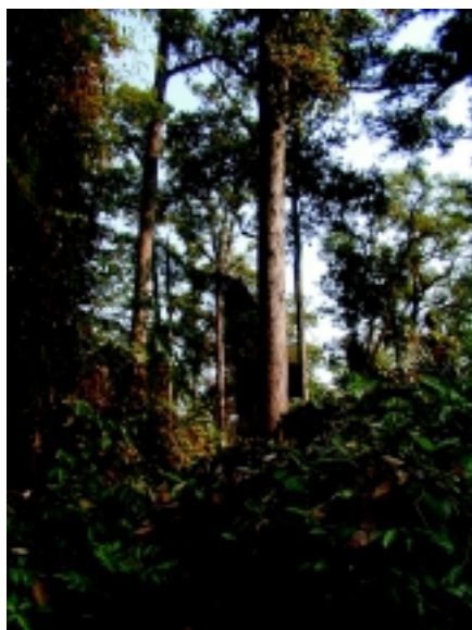
Monospecific natural stand of Dipterocarpus alatus near Vientiane, Laos.

Vegetative propagation by cuttings taken from coppice shoots produced after hedging has been tried with success.