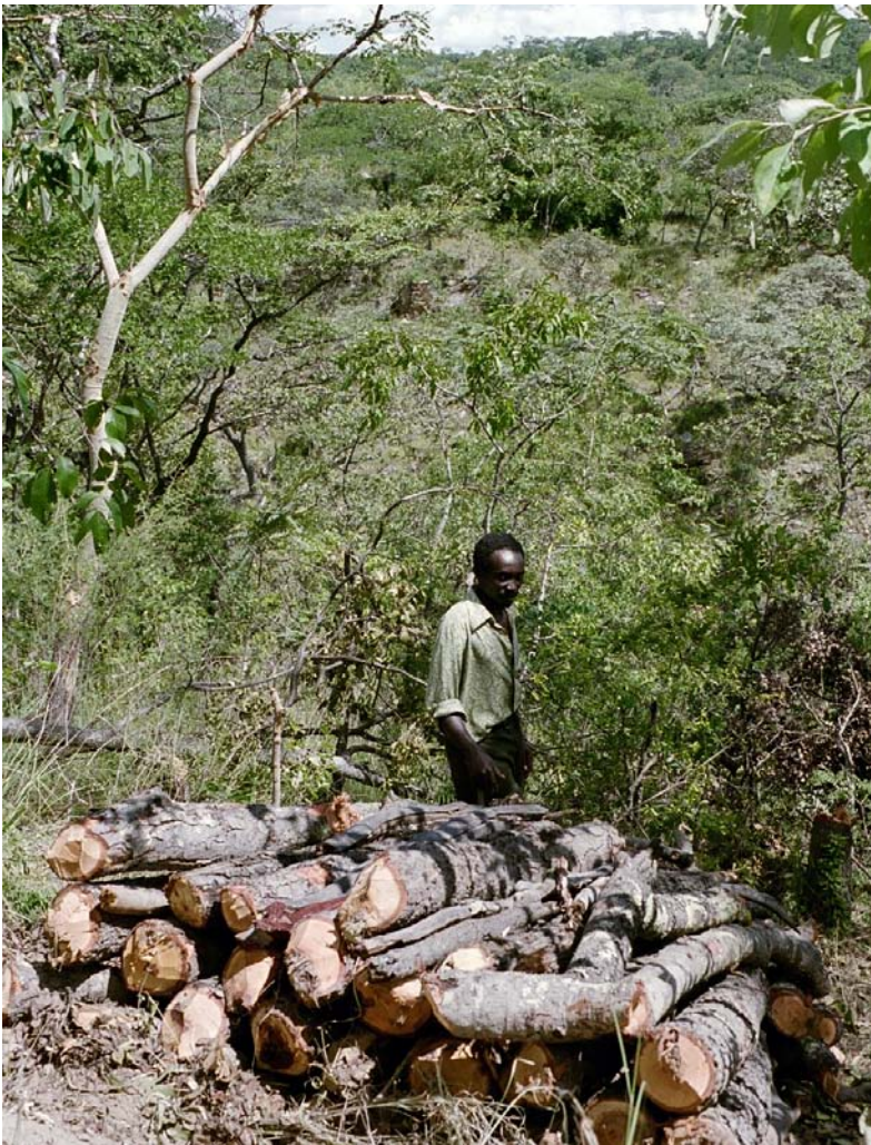
Preparations for an illegal charcoal kiln discovered during forest patrol under a locally-based monitoring scheme, Tanzania.

takes place in a context of power struggles over access to benefits from collaborative forest management. For many, VNRC membership was regarded a lucrative position in terms of salaries and allowances as well as access to illicit benefits through collusion with resource users and embezzlement. The real and perceived oversight by fellow villagers and the District Forest Office (that receives the monthly reports) implies that individual VNRC members appeared to have considerable incentives to report positive trends in ecological monitoring data and conceal discrepancies in financial management by withholding or only presenting one source of information. It is thus clear that the monitoring information understates the magnitude of financial flows and utilization levels – albeit to an unknown extent – implying that the communicated information is impaired in relation to assessing resource use patterns and ensuring sustainability.