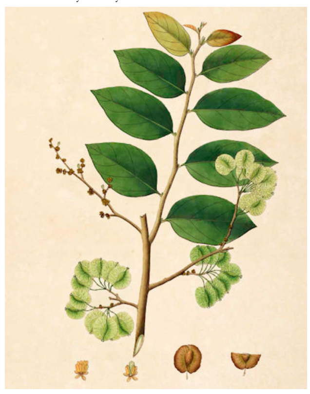
Branch of Holoptelea integrifolia

bark when cut and the leaves and twigs when crushed emit an unpleasant odour. Flowers are polygamous, greenish-yellow, in short racemes, or fascicles. No of stamens are 8 in male flowers, 5 in bisexual flowers; anthers are hairy. Ovary is unilocular and stalked.