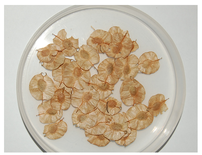
Fruits of Holoptelea integrifolia