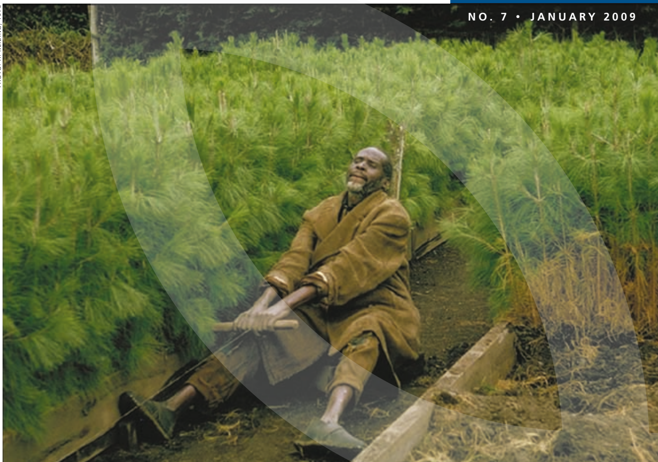
Root cutting of Pinus patula in a nursery, Kenya