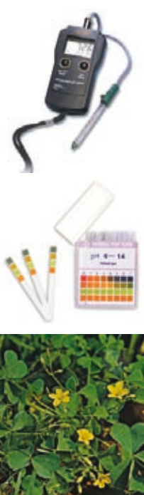
Figure 3. Methods to check soil acidity. Top, electronic pH meter; centre, indicator strips; bottom, indicator plant, here example of an Oxalis species