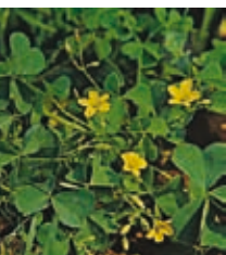
Figure 3. Methods to check soil acidity. Top, electronic pH meter; centre, indicator strips; bottom, indicator plant, here example of an Oxalis species