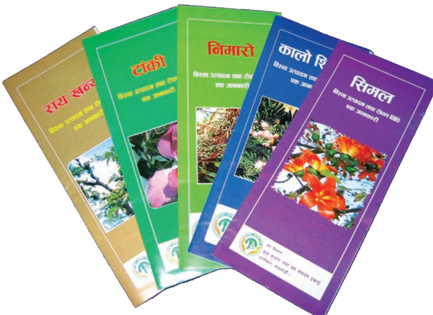
Examples of species pamphlets distributed together with tree seed in Nepal

Detailed information, which cannot be added to the seed bags, may be distributed along with or inside the seed bags. Species brochures can contain detailed information on species use, growth habit, propagation, care and maintenance.