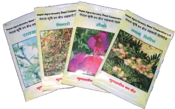
Small bags used for distribution of tree seed in Nepal