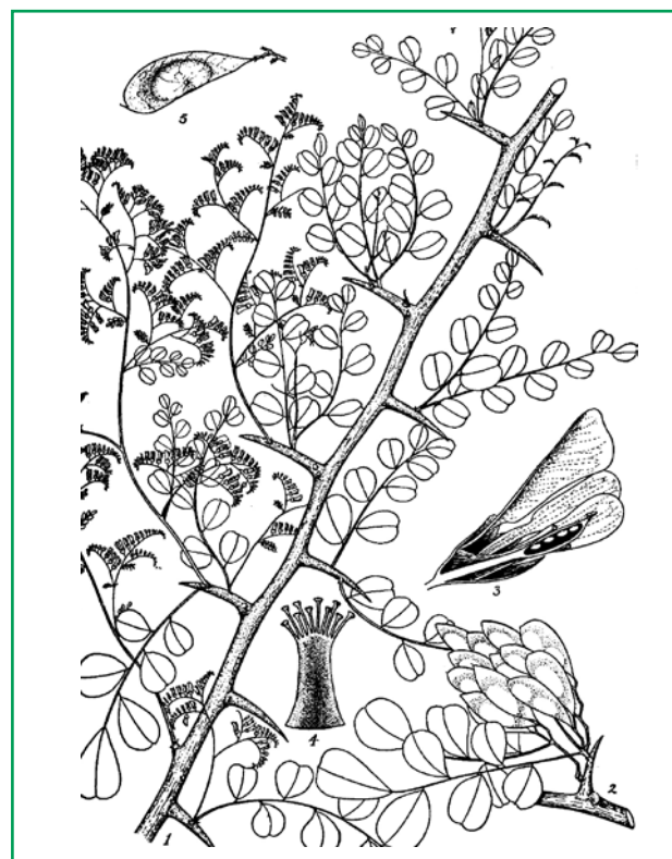
Dalbergia melanoxylon , 1. flowering branchlet, 2. fruiting panicle, 3. flower, 4. staminal sheath, 5. immature fruit. From: Kenya Trees and Shrubs, Dale and Greenway 1961.

The white, sweetly scented asymmetrical flowers are 5 mm long, with a slightly pubescent calyx, and usually 9 stamens. The 3-12 cm long, laxly branched and many flowered panicles appear with the new leaves.