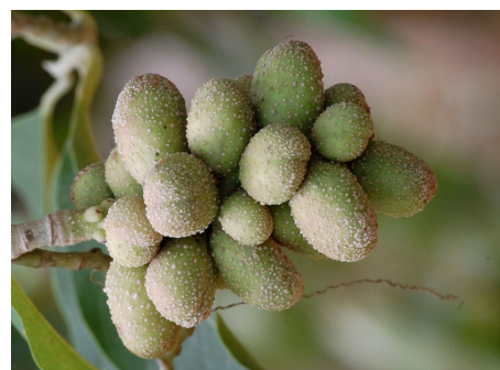
Fruits of Michelia champaca