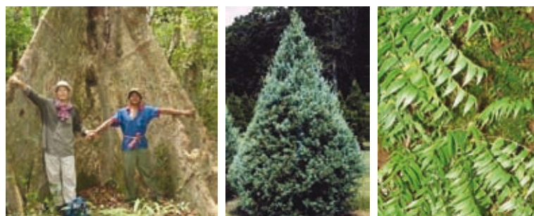
Figure 3. Some morphological adaptations to wind stress.

Moving sand may cover low vegetation parts including young trees and low branches. An adaptation for growing in moving sand is the ability to re-grow after coverage (figure 2).