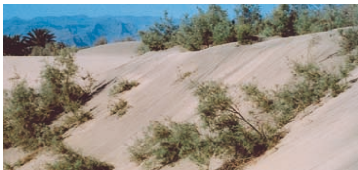
Figure 2. Species growing in moving sand has an ability to tolerate partly exposure of the roots and will re-grow if covered by sand.

Right: Divided leaves easier escape damage by tearing and lodging during strong winds.