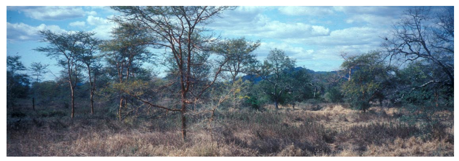
Acacia seyal, one of the most common species on cracking clay soil in Lower Shire, Malawi.