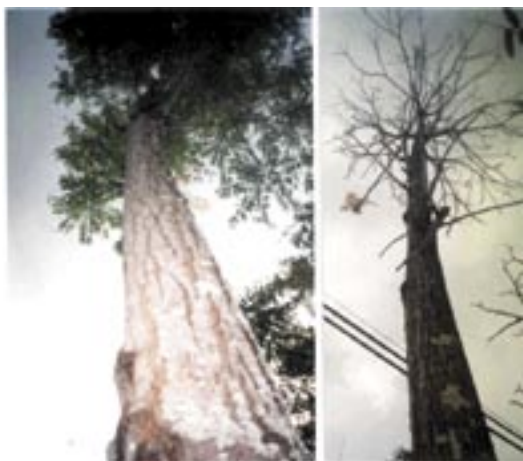
Rural forest of Toona sureni , Cianjur, West Java, Indonesia.

Seed usually retains its viability for only 2-3 months, but cool storage can increase this period. In a study by Seed Technology Centre (Bogor), seed that was stored in air-conditioned room (18-20°C) for 5 months had a germination rate of 56 %.