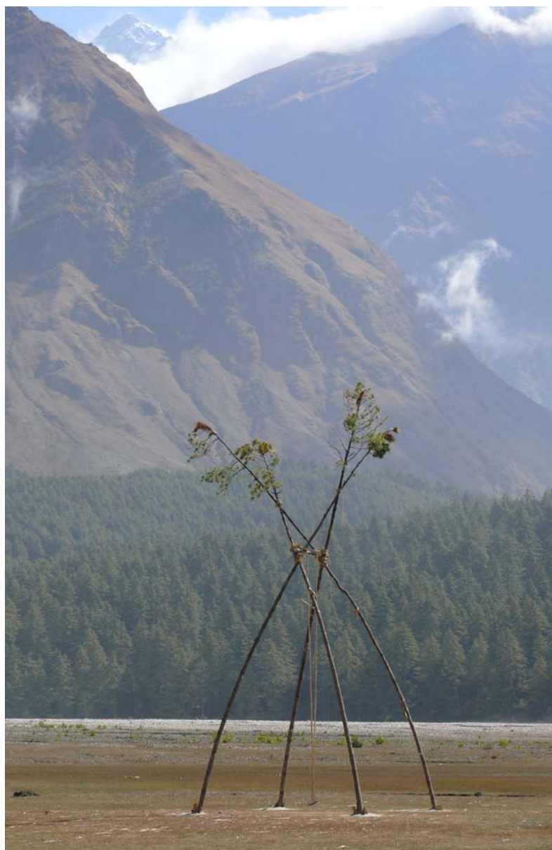
Table 3: Average annual CFUG expenditure in NRs divided on income quartile and source (Lund et al. 2010)

Lund et al. (2010) also show that 50% of the total community development expenditure is attributable to a mere four